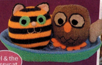
Owl & the pussycat